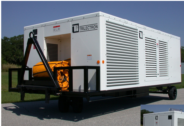
Model DAC20 Trailer Mounted